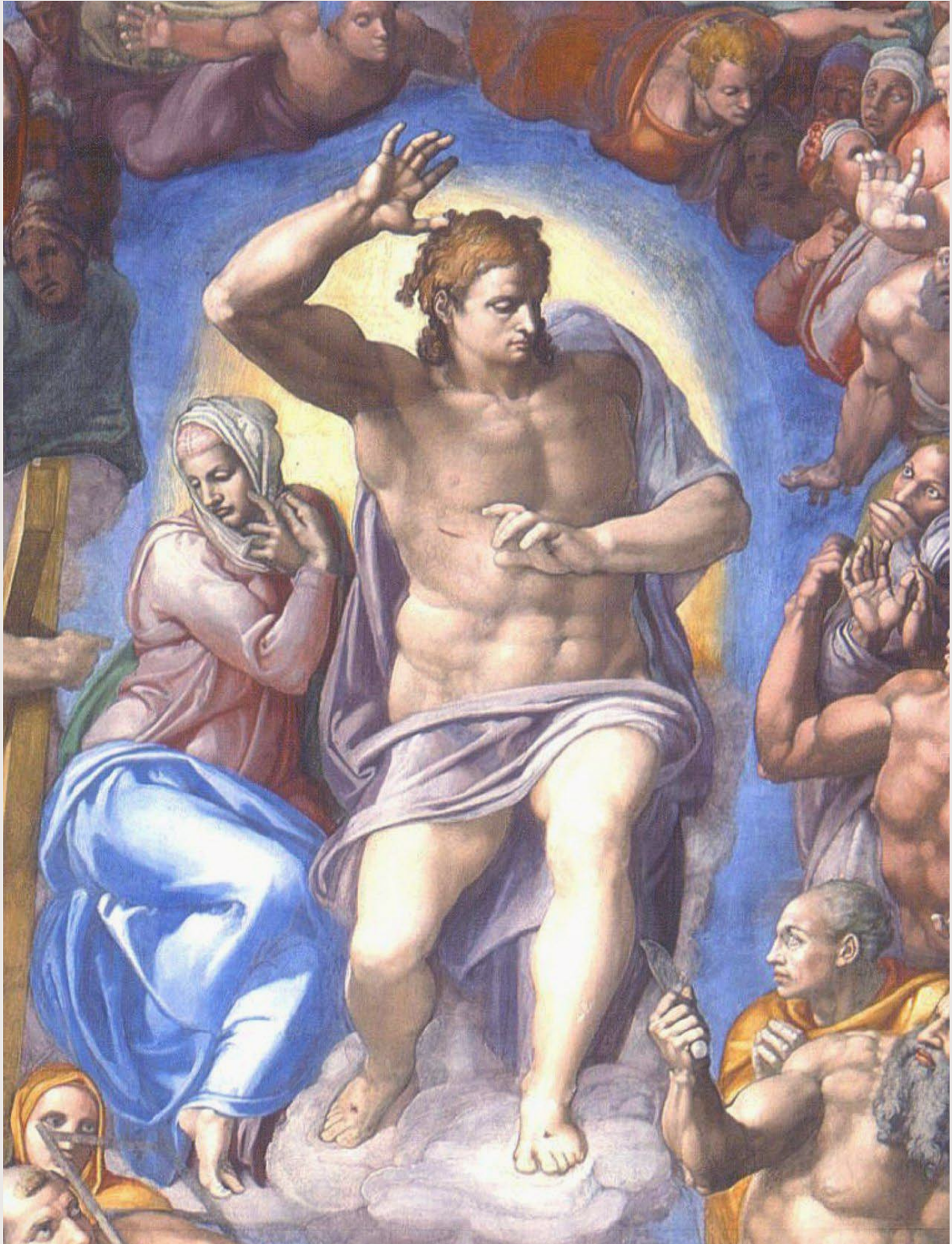
Painting of Christ in "The Last Judgement" - Sistine Chapel by Michelangelo