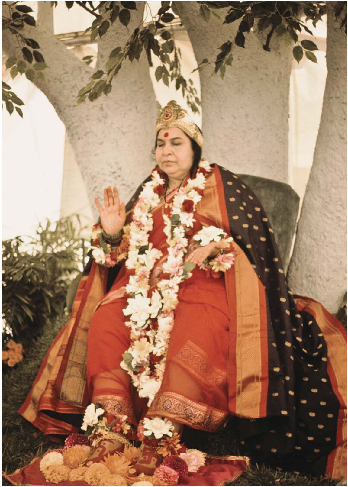
Shri Buddha Puja 1988 US