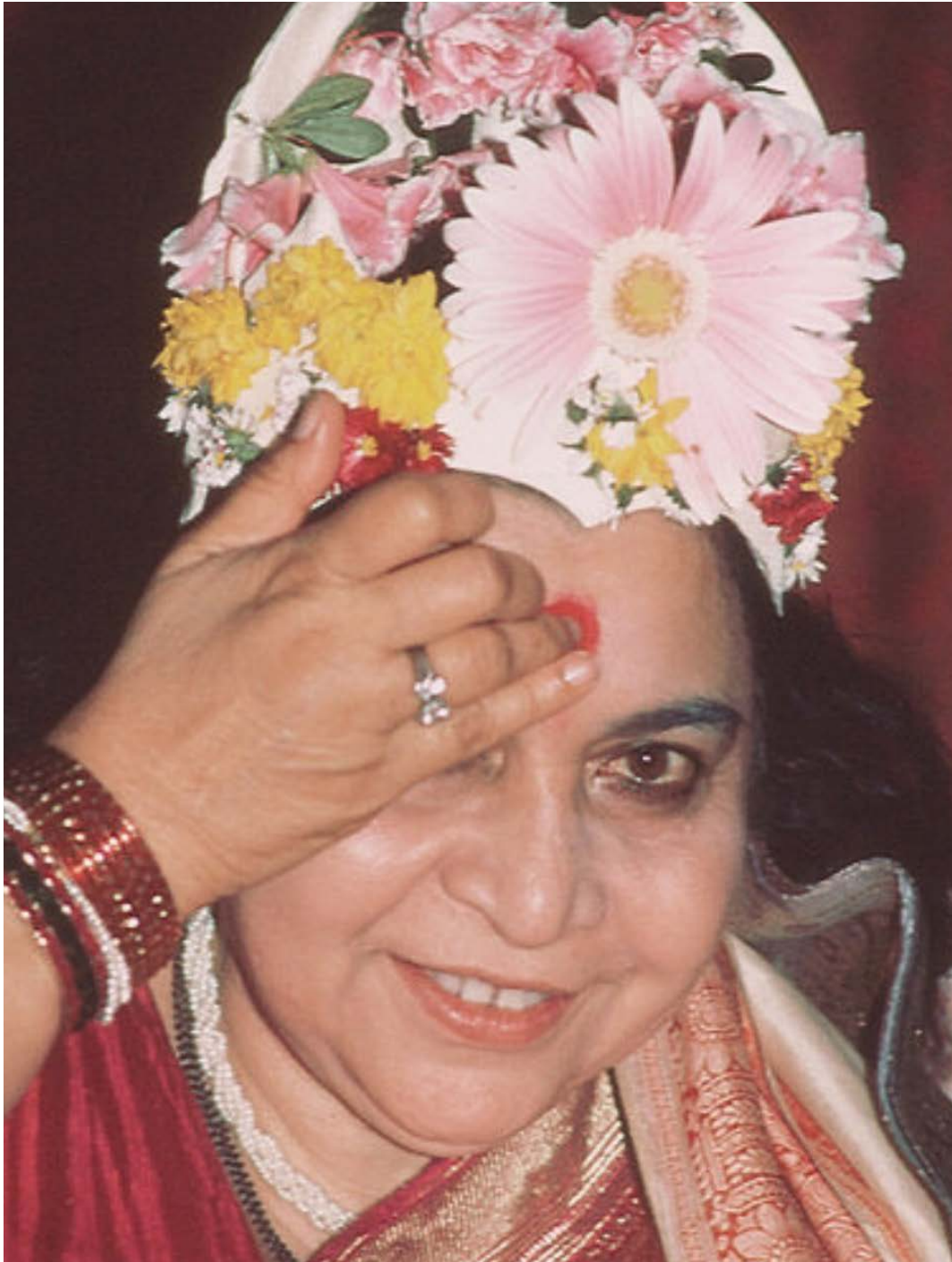
Sahasrara Puja 1984