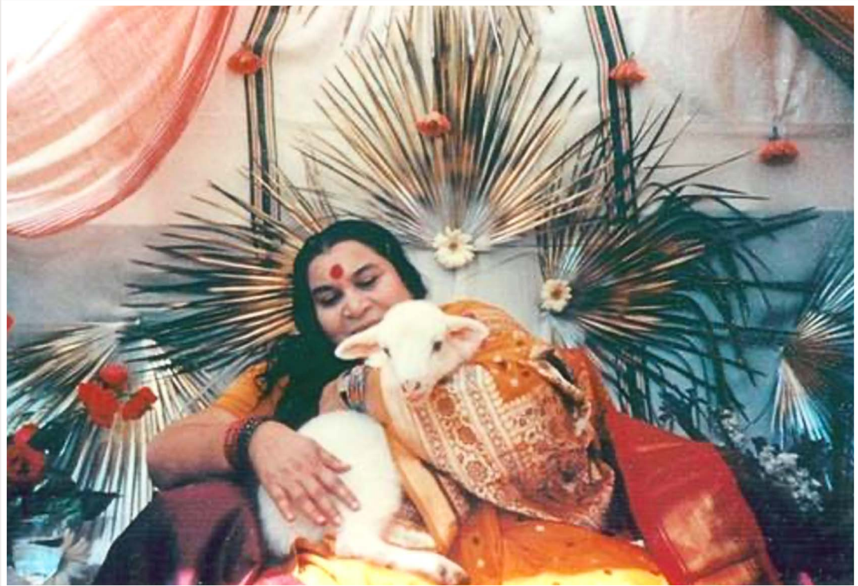
Easter Puja 1987, Italy