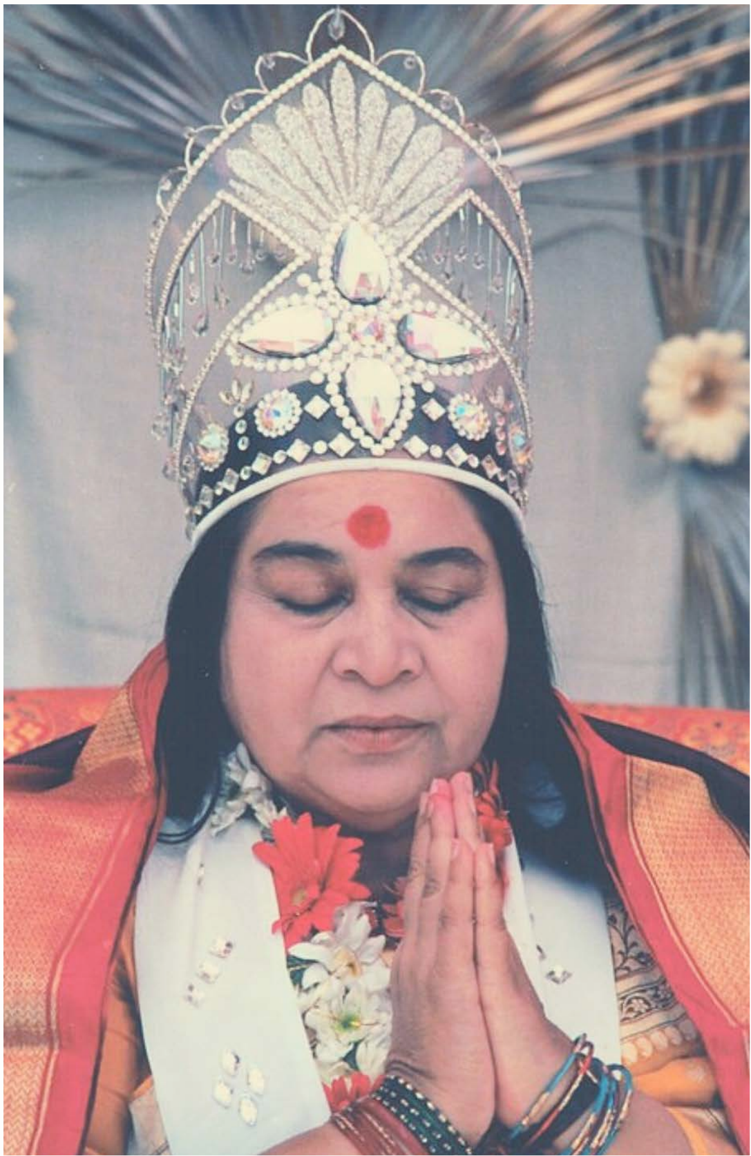
Easter Puja 1987 Italy