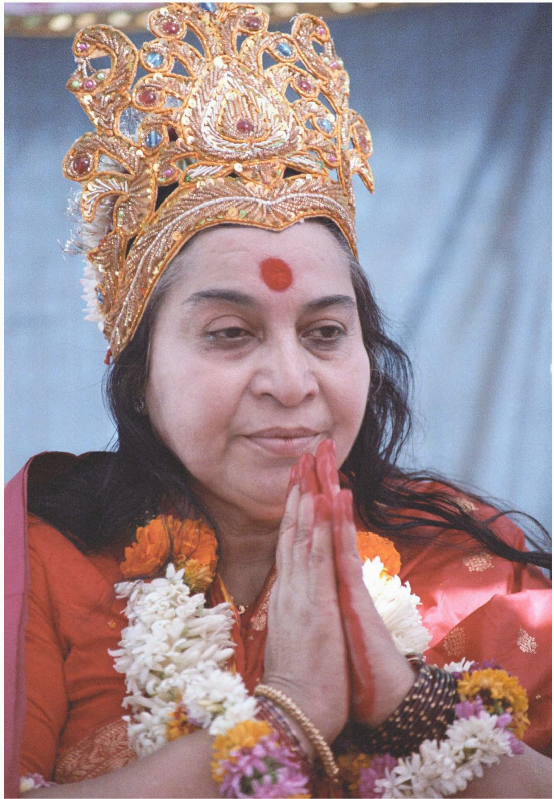
Puja 1982/83 India Tour